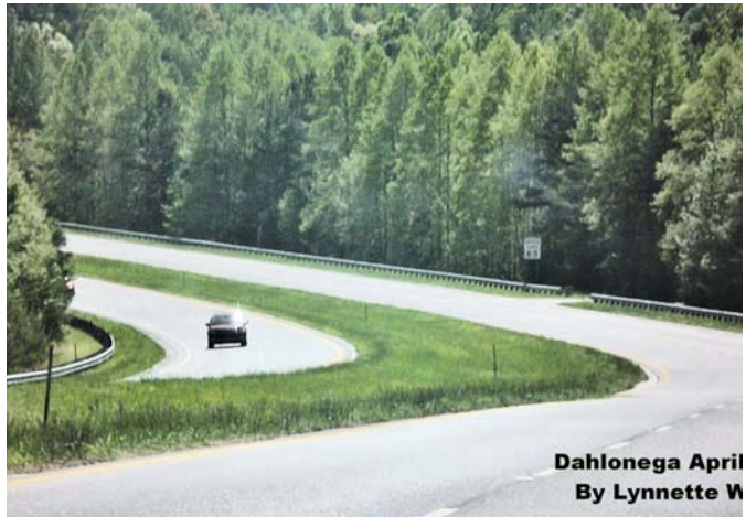
Dahlonega April By Lynnette W

All of the pictures above, including the background picture in the first frame, were taken in various locations in North Georgia during the summer of 2010. The top picture is of Georgia SR 400 in Dawson County, Georgia. The picture below it on the left (west to you surveyors) was taken in the City of Cumming. The picture to the right is of a winding road on a hill (horizontal and vertical curves to you engineers) was taken on Market Place Boulevard.